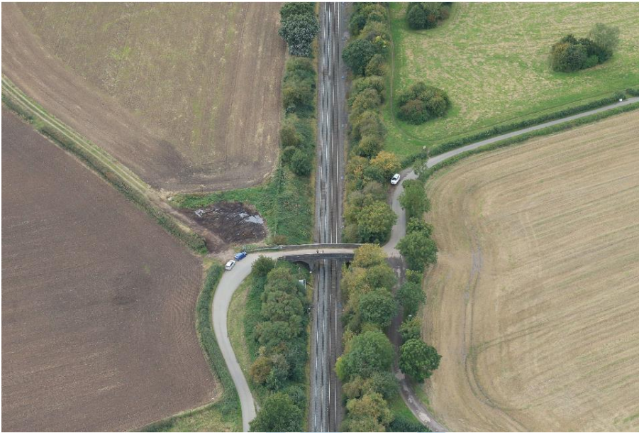
Burbage Common Road Overbridge (Existing)